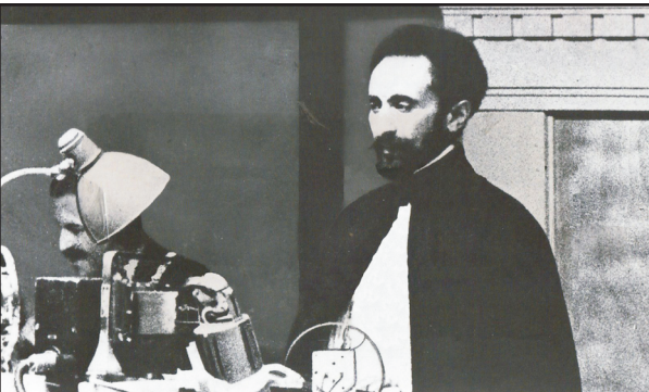
Emperor Haile Selassie I at his iconic League of Nations speech in 1936. As he left the podium, he said: "Today it is us; tomorrow it is you."

Ethiopians. This is not just because Ethiopia is finally recovering from the cultural devastation of the coup of 1974. It is also related to the fact that the transforming global social environment is forcing many people around the world to become